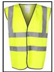
YELLOW VEST Day/Night