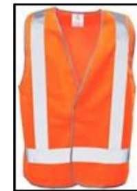
ORANGE VEST Day/Night