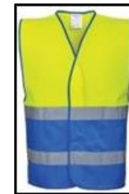
BUYERS VEST Yellow & Blue